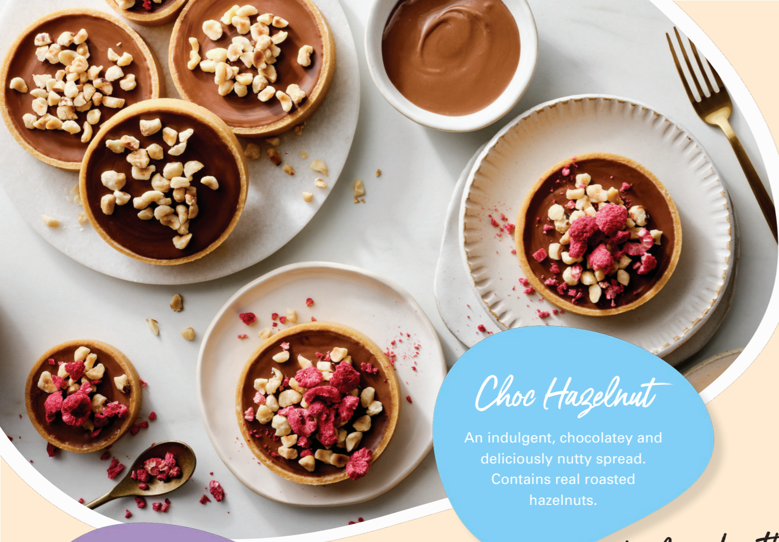
Choc Hazelnut An indulgent, chocolatey and deliciously nutty spread. Contains real roasted hazelnuts.