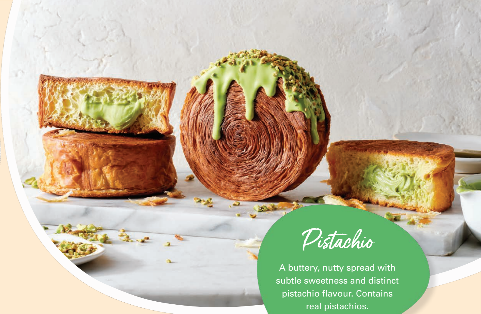
Pistachio A buttery, nutty spread with subtle sweetness and distinct pistachio flavour. Contains real pistachios.

Each flavour developed with high quality ingredients