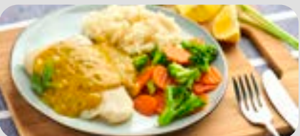
FISH MEALS White Fish with Mustard Sauce, Mash and Veggies