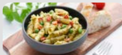
VEGETARIAN & VEGAN MEALS Mamma's Vegetarian Pesto Penne