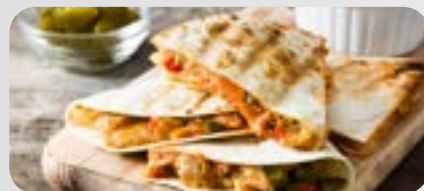
SNACKS & LIGHT MEALS Smoky Chipotle Chicken Quesadillas