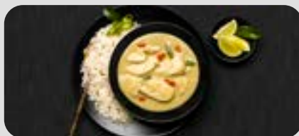
CHICKEN MEAL Classic Thai Green Curry with Rice