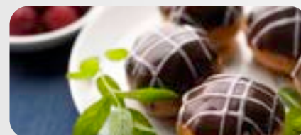
MULTI-PACK CAKES & PASTRIES Chocolate Profiterole Treats