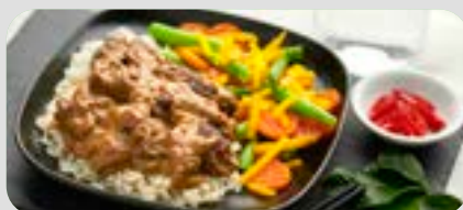
MEAT MEALS Malaysian-Style Beef Rendang with Rice