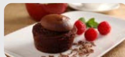
CAKES AND PASTRIES Chocolate Cream Cake