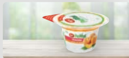
PROVITAL SPC ProVital Peaches Diced in Juice