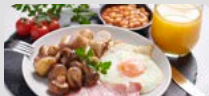
BREAKFAST Full English Breakfast

With over two decades of experience in supplying healthy snap frozen meals, spreading the joy of food across Australia is part of the Good Meal Co dedication, and this ensures that everyone in need of nourishing, delicious, restaurant quality meals can eat, feel and live better.