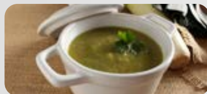
SOUP Classic Potato and Leek Soup