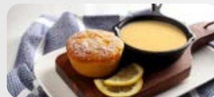
PREMIUM DESSERTS Lemon Pudding with Custard